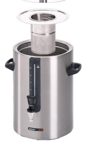
For making tea in a container, place the special tea filter with