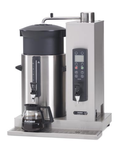
ComBi-line with a 10 litres container on the left side and a separate water boiler in the unit: CB 1x10W L.

Tea can be made just as easily with the same machine. A special tea filter with filler pipe is available for this. No tea leaves in the tea and no used tea bags to be cleared away. Perfect.